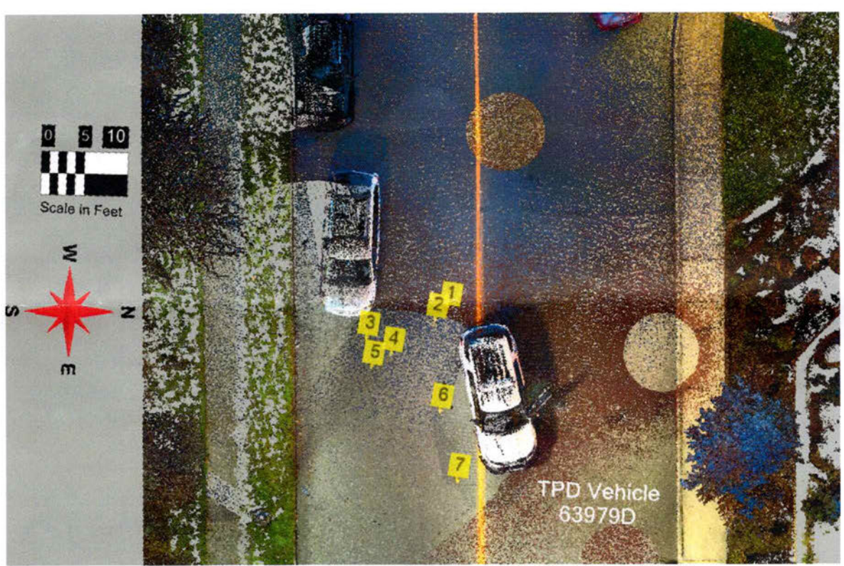
Figure 2: Evidence items 1-7 south of TPD Vehicle 63979D

Laboratory Number: 122-000605 Request Number: 0001